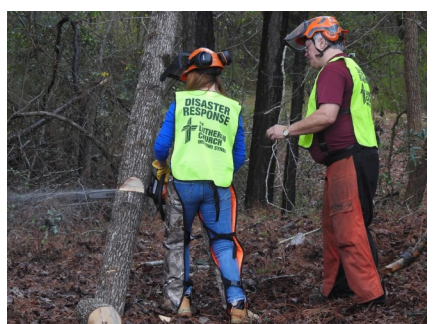
Notching a tree