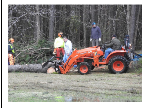
"Sally" the tractor