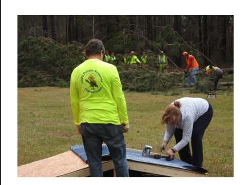
Tarp & Chain Saw Training