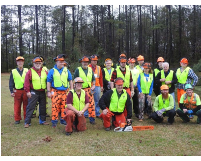
Smiles after a hard days work