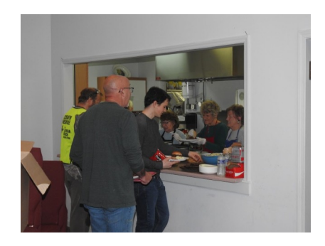
BBQ Lunch for the volunteers