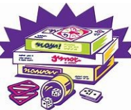
Family Game Night